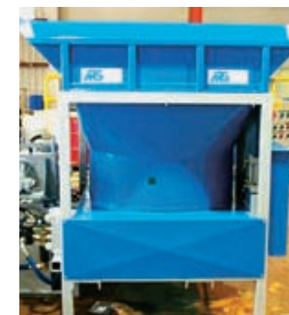
We offer hopper extensions to add storage space to the briquetter. This extension adds approximately 4 cubic yards worth of storage space to the foundry series.

* Production is based on an average input density. If the input density is lower the production will be lower than the throughput stated. Production numbers can be guaranteed if a sample is run.