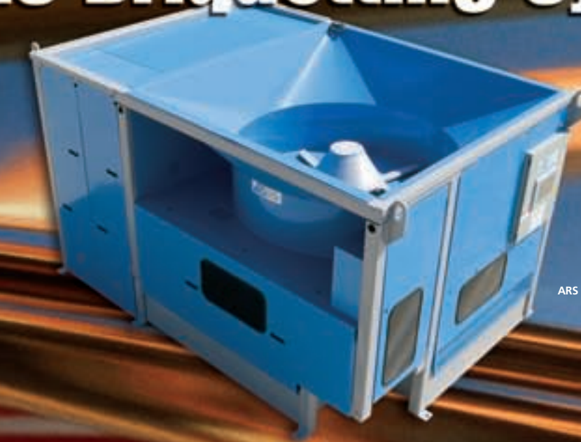
ARS BRIQUETTER MODEL RST 3000