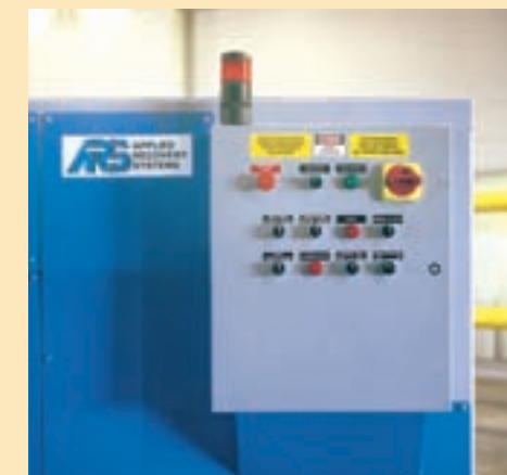
ARS Briquetters are simple to operate. Employees require little training and become proficient in minimal time.

In some occasions, Applied Recovery Systems have offered lease options to help our customers secure an order. Please contact us for more information or to fill out a credit application.