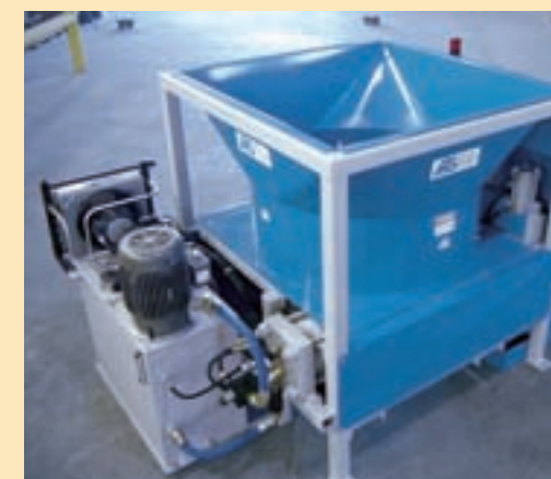
A sturdy frame of heavy-wall structural tubing protects the hopper from damage when loading.